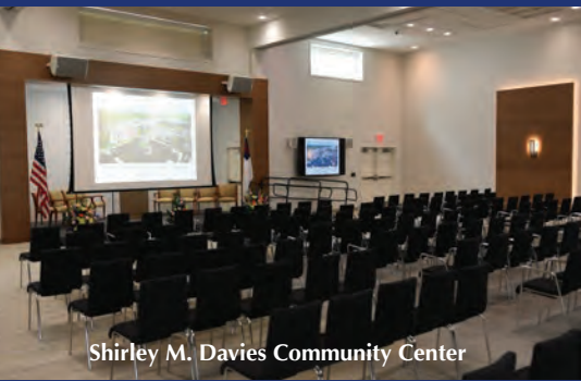
Shirley M. Davies Community Center