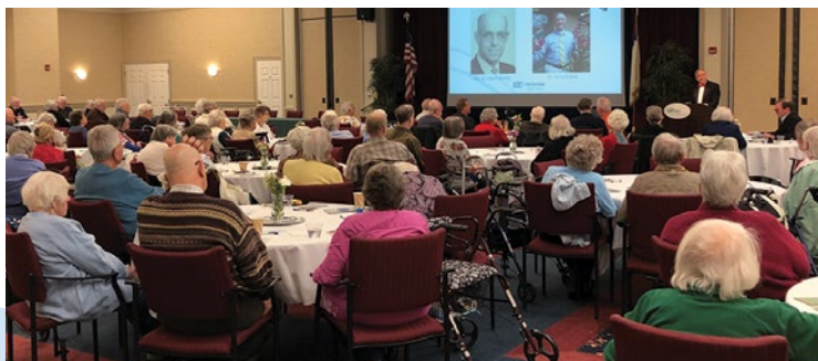
The crowd enjoys "The History of Twin Towers"

Our Foundation team believes we are all called to be a blessing to others and one individual can make a tremendous impact in blessing someone's life. For more information on being a Philanthropic Hero, visit lec.org/NEXT100 .