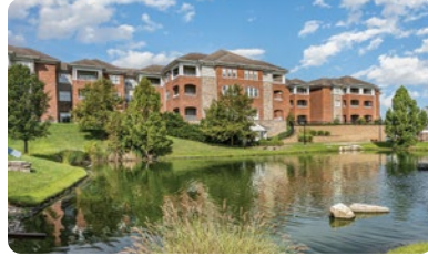
Twin Lakes Montgomery: 513-247-1300