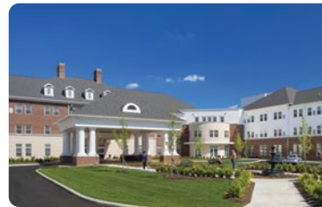
Wesley Woods New Albany: 614-924-0030