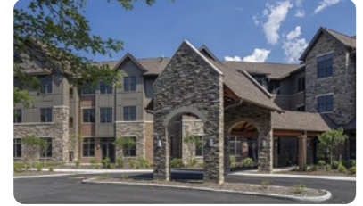
Concord Reserve Westlake: 440-871-0090