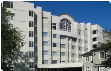
Wesley Glen Clintonville: 614-888-7492