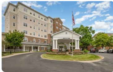
Wesley Ridge Reynoldsburg: 614-759-0023