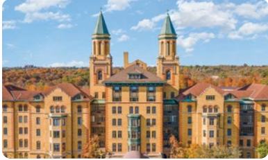
Twin Towers College Hill: 513-853-2000